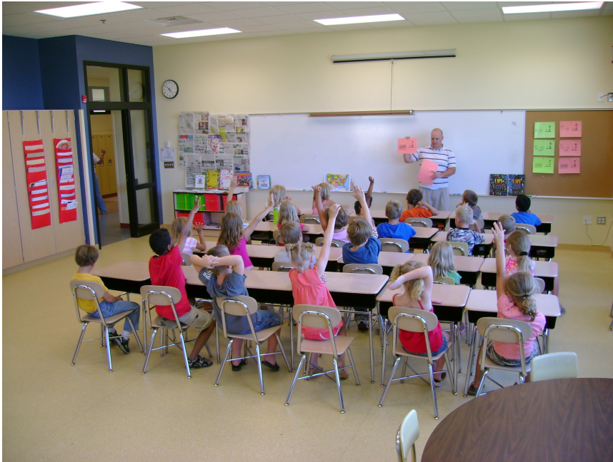
← Teacher working with 24 students